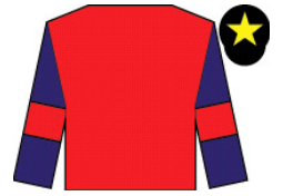
LAND OF OZ