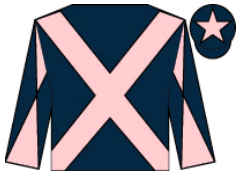
COEUR DE LION