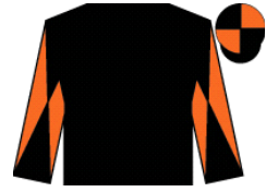
CLIFFS OF DOONEEN