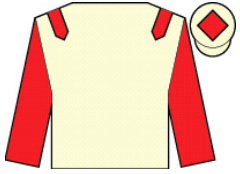
SOUND OF CANNONS